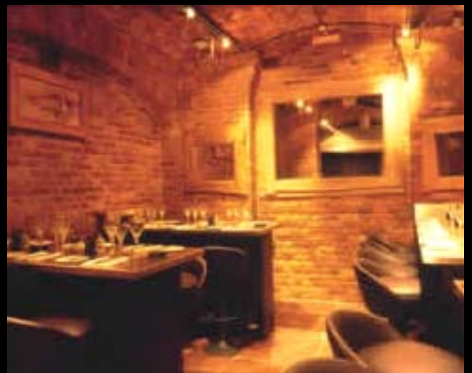
Private Room Hire