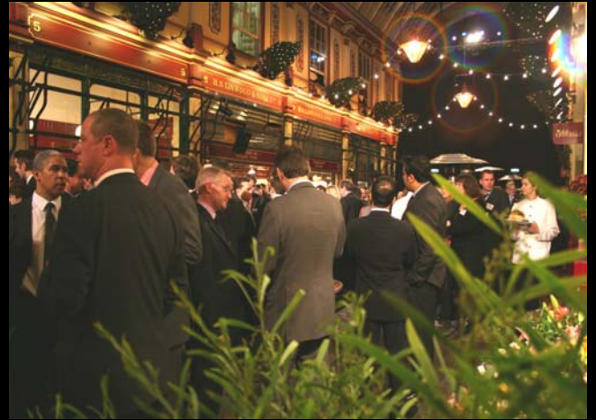
Drinks Reception 600 pax