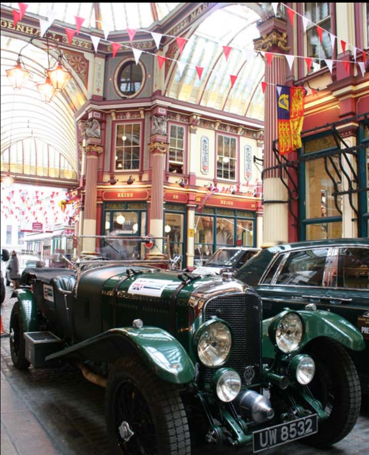
Debrett's Classic Car Rally