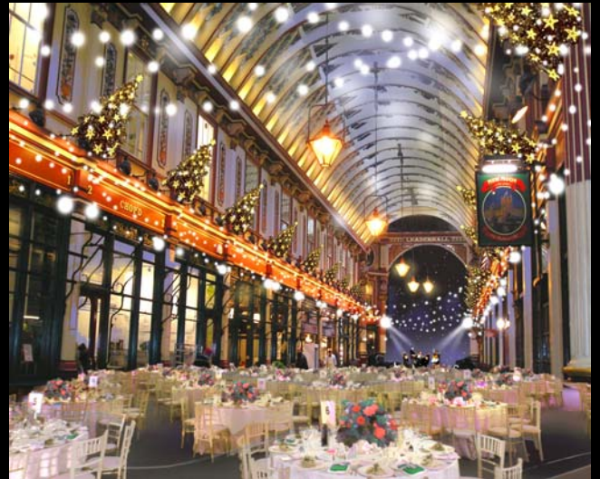
Sit Down Dinner for 200pax