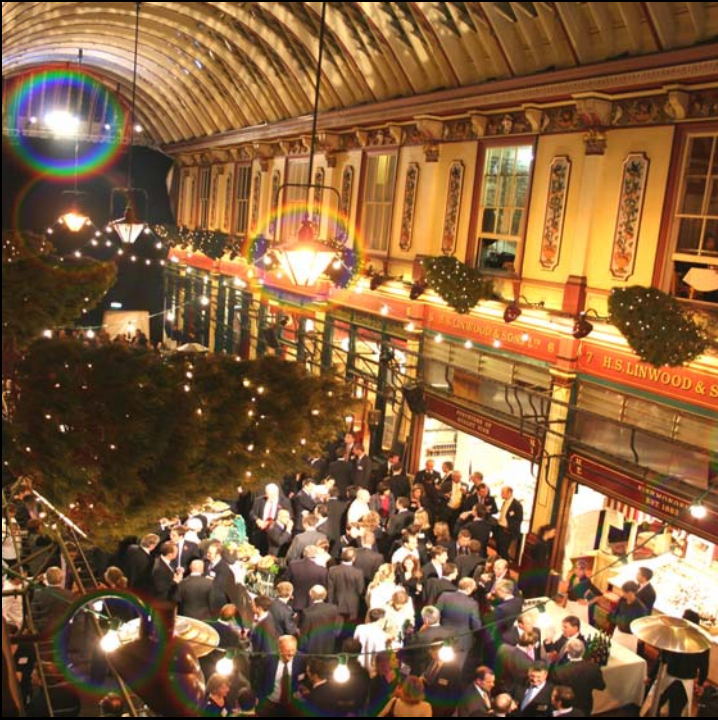
Christmas Party 500 pax